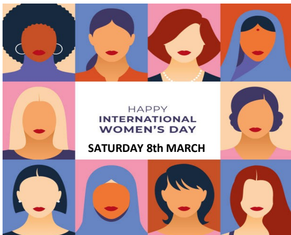
International Women's Day Gallery